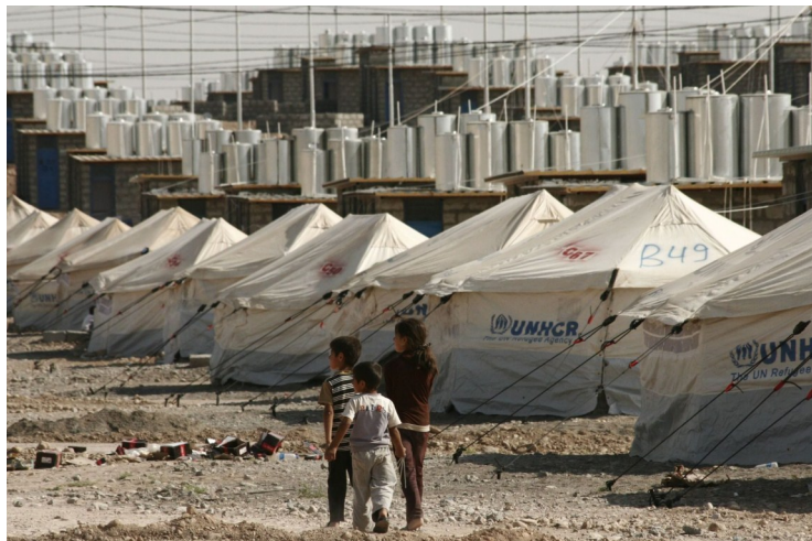
Darashakran camp in the Kurdistan Region, Northern Iraq.