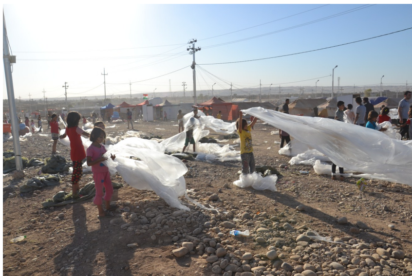
Children playing with plastic sheets following ACTED/UNHCR distribution of core relief items in Kawergosk camp, northern Iraq.