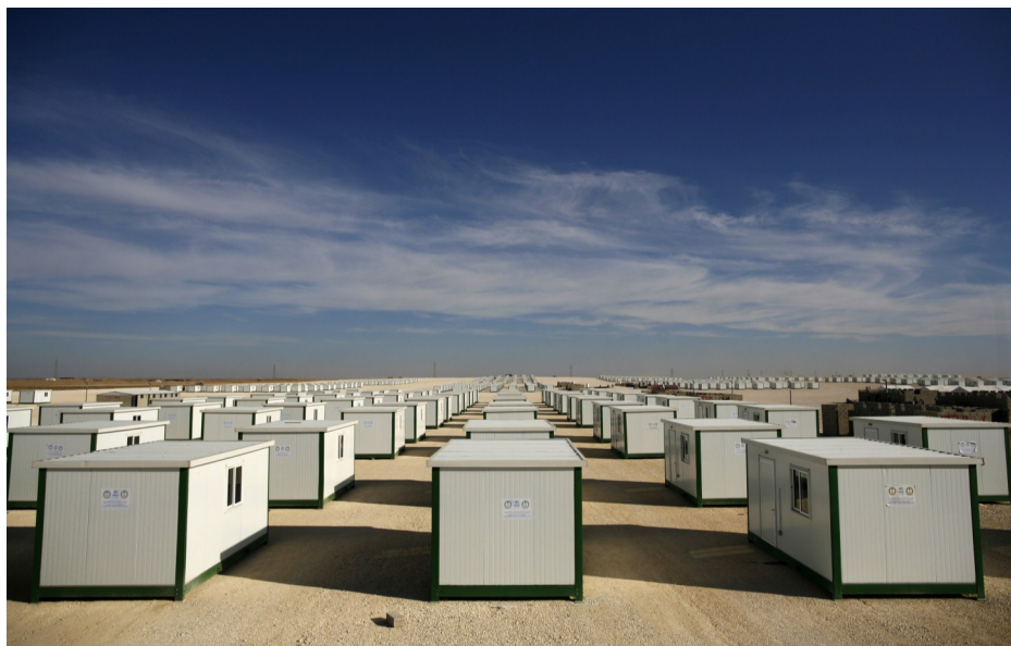
Thousands of caravans have been distributed in Zaatari camp, with only some 1,000 tents remaining.