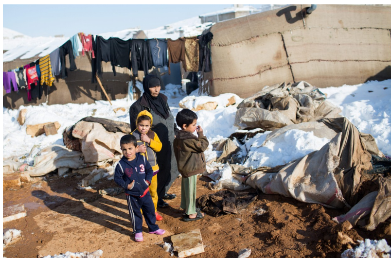
A Syrian refugee with three of her children in the tented settlement where they are living in eastern Lebanon.