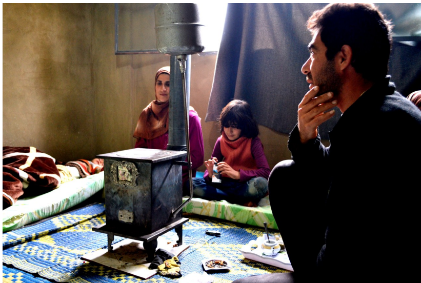
Syrian refugees living in a collective shelter in Akkar, North Lebanon.