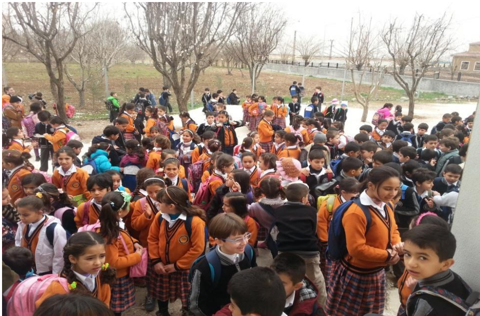
The Government of Turkey takes the lead role for determining and implementing assistance provided to Syrian refugees, through the Prime Ministry Disaster and Emergency Management Presidency (AFAD). AFAD reports spending 2.5 billion USD on the Syrian Refugee Response in Turkey.

With support from IOM, transport was provided to 778 children in Sanliurfa province. Children attend this school 5 days per week in two shifts. Contingent on the availability of funds, IOM is planning to expand this service to other provinces.