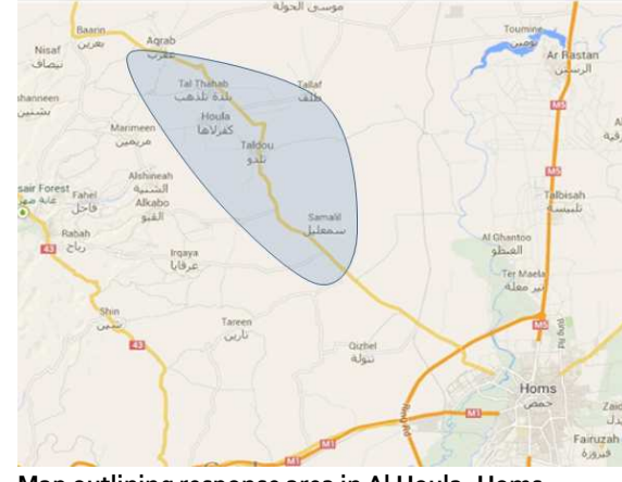
Map outlining response area in Al Houla, Homs

UNICEF and partners have devised a comprehensive strategy to provide humanitarian assistance, including through inter-agency cross line convoys. During the reporting period, UNICEF participated in a cross-line mission to Al Houla, an area in northern Homs, which has been under siege for the last two years. The joint convoy successfully delivered critical health, nutrition and WASH supplies, reaching 20,000 people in Al Houla, including 10,000 doses of polio vaccine (the first time vaccines have reached this area), and 2,000 vaccines for routine immunization. The mission was also instrumental in rapidly assessing the needs in the area, and meeting with partners in developing longer-term strategies to ensure continuous access to deliver life-saving programmes to an estimated 70,000 residents of the area.