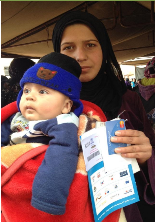
A syrian refugee upon receiving a WFP electronic card in Arsal, Bekaa