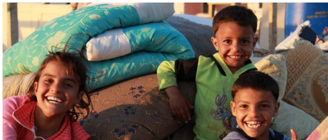
Children in Informal tented Settlements

NFI kits comprising one blanket per person, four mattresses, one kitchen set, and one hygiene/baby kit per family were given to 61,615 newcomers.