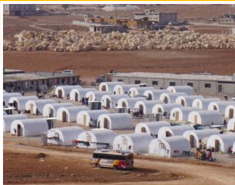
Arsaal - Formal Tented Settlements - Shelter Sector Working Group

UNHCR, DRC, and Dar El Fatwa have boosted their efforts to identify additional plots for formal tented settlements. In total, 16 newly identified sites (in Akkar – Beka'a – Mount Lebanon and South Lebanon) are currently undergoing technical assessment. If technically sound and government approved, the new sites would provide shelter to nearly 1,403 HH (7,015 individuals).