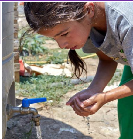
Girl drinking from water tank in Aarsal