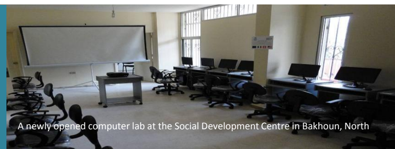
A newly opened computer lab at the Social Development Centre in Bakhoun, North