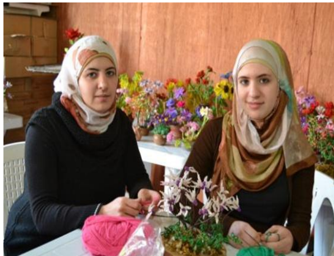
Graduates of the handcraft training at the Forum of the Handicapped community centre, in Tripoli, north Lebanon

A graduation ceremony was held at the Forum of Handicapped centre in Tripoli for 249 individuals who completed handcraft and life skills training sessions.