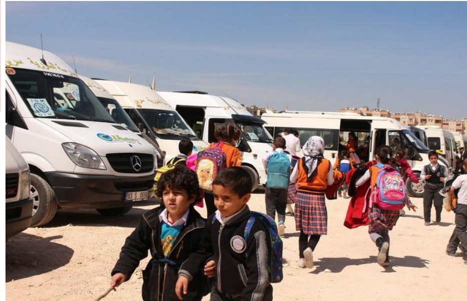
Refugee children assisted with transport to school in Urfa

With support from IOM, transport assistance continued to be provided to 778 children in Sanliurfa province. Children attend school 5 days per week in two shifts (from 08:00 to 12:00 and from 12:30 to 16:30). Contingent on the availability of funds, IOM is planning to expand this service to other provinces.