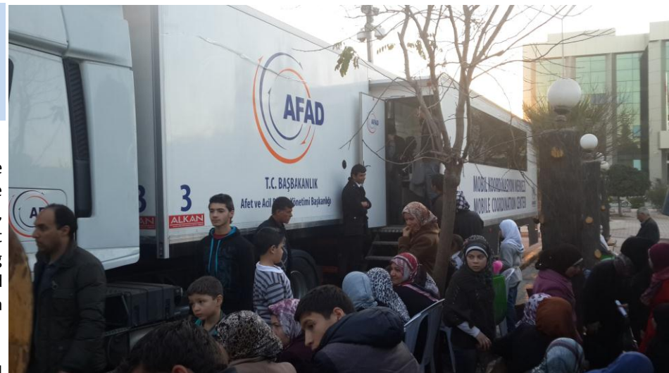
Queuing at mobile registration centres