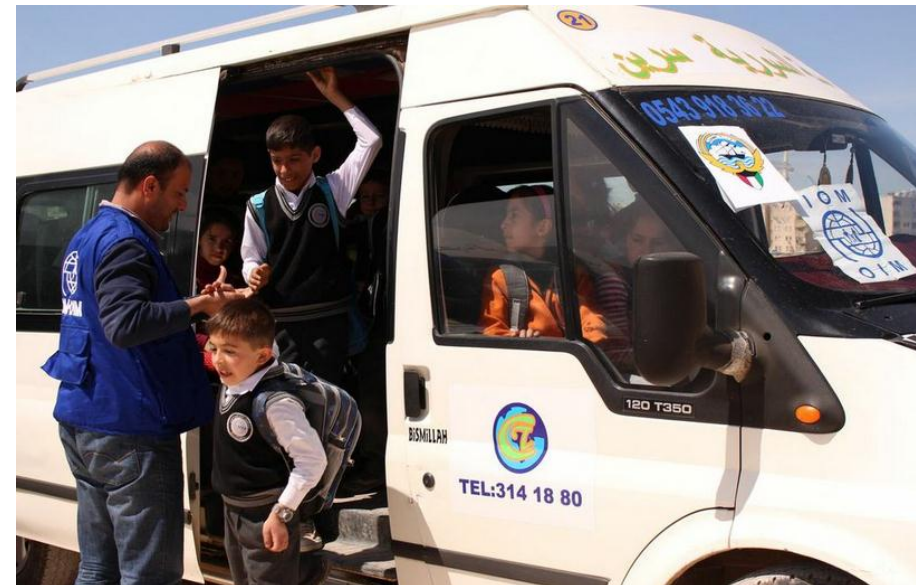
Refugee children assisted with transport to school in Urfa/IOM 2014

With support from IOM, transport assistance continued to be provided to 778 children in Sanliurfa province. Children attend school 5 days per week in two shifts (from 08:00 to 12:00 and from 12:30 to 16:30). Contingent on the availability of funds, IOM is planning to expand this service to other provinces. In early April, IOM met with teachers, parents, school children and drivers and were informed that the system was running smoothly. Parents noted their appreciation and were pleased with the service, which allowed their children to attend school regularly and safely.