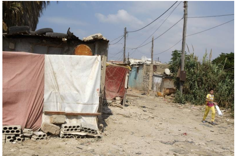
A young Syrian refugee walks past shelters in Tripoli's Al Tanak district.