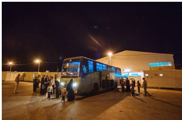
Refugees arrive from the Syrian border at the Rabaa al-Sarhan registration centre, where they are processed by the Jordanian government and UNHCR.