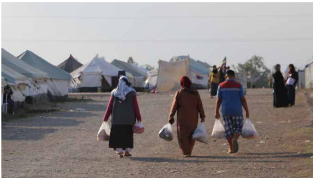
Beneficiaries in Osmaniye camp carry food stuffs purchased with the WFP/TRC E-Food card in camp markets.

In order to support the programme reaching 220,000 beneficiaries, the total monthly requirement is US$6.7 million. The Operational Pipeline Report shows a break in mid-June for July with a total of US$6.5 million to be adjusted to reflect actual caseload and needs. The total operational pipeline shortfall in 2014 is approximately US$60 million.