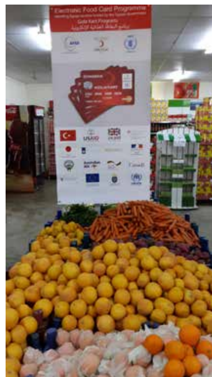
WFP/TRC and donor visibility throughout participating camp markets.

Joint WFP/TRC teams assessed four camps--Malatya, Akçakale, Nusaybin and Viransehir-- to determine the readiness of camp infrastructure to join the E-Food Card Programme. Considering assessment findings, WFP with the Turkish Red Crescent (TRC) expanded to Midyat camp at the beginning of April. Expanding to Midyat increased the caseload by approximately 3,300 beneficiaries per month, thereby providing food assistance to a total of just under 145,000 beneficiaries per month through the WFP/TRC E-Food Card Programme. WFP worked with TRC and AFAD to conduct trainings for beneficiaries, shopkeepers and camp management in order to ensure a smooth transition. In May, WFP will expand the programme to three new camps—Malatya, Kilis Elbeyli and Akçakale and will initiate the cost-sharing agreement with AFAD in all camps being assisted by the WFP/TRC programme.