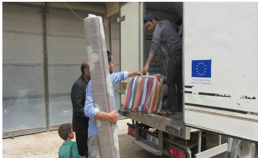
Provision of NFI to Syrians in Kumlu village in Hatay province.

Since the beginning of the year IOM has supported 4,696 families in Hatay and 87 families in Adiyaman with non-food items. In addition, IOM is working on voucher programs with implementing partners for about 2,000 families in Hatay province where each individual will be supported with 30 TL for food and each family with 40 TL for hygiene items.