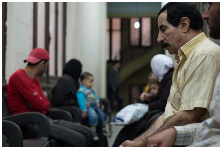
Syrian refugees in the reception area of Caritas Alexandria awaiting an interview with social workers. Caritas Alexandria provides counselling, cash assistance and health care services to Syrian refugees.

On 21 May, UNHCR held a meeting with the Syrian community in Haram and Faysal to raise awareness on residency issues and, particularly, the risks of irregular movements, and on the resettlement process – stressing that it was done exclusively through UNHCR and always for free. At the end of the meeting, UNHCR identified several vulnerable cases and referred them to the concerned units.