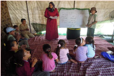
Education in Jordan. UNICEF.