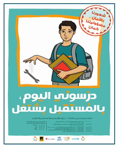
Amani Campaign Child Labour Poster