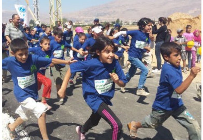
Syrian refugee children at a settlement in Bekaa Valley, Lebanon, participate in a race to kick off Immunization Week.