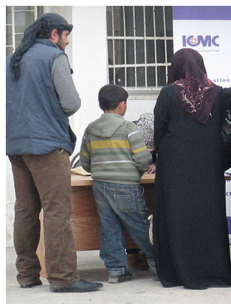
A Syrian family register at an ICMC winterization NFI distribution in Ajloun, Jordan.

Additionally, after listening to and responding to beneficiaries demands; ICMC also plans to distribute adult diapers; aimed to assist vulnerable elderly people live with increased dignity.