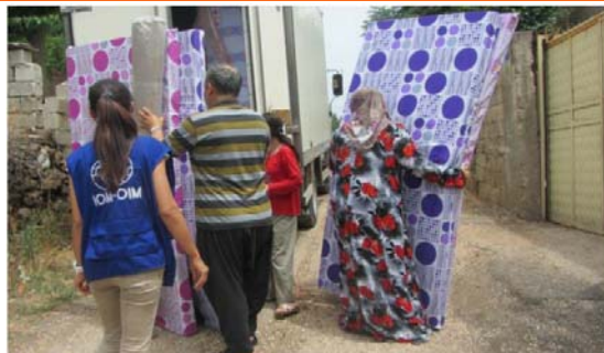
Provision of NFIs to Syrians in Hatay province, Turkey.

Also in Jordan, a the Task Force on Gender-Age-Disability will circulate a survey on gender mainstreaming in cash projects. This will serve to get a sense of what GAD-related information organizations are already collecting or are planning to collect and identify gaps in order to address them during the gender workshop scheduled for mid-August.