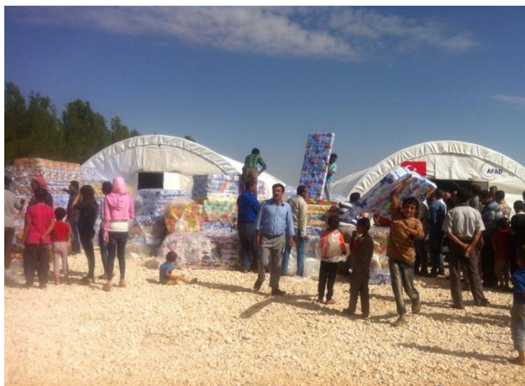
Distribution of mattresses at YIBO boarding school

refugees. Two more rub halls are being prepared in addition to the 36 already operational. AFAD reported that WASH containers to serve these new rub halls have been requested to HQ.