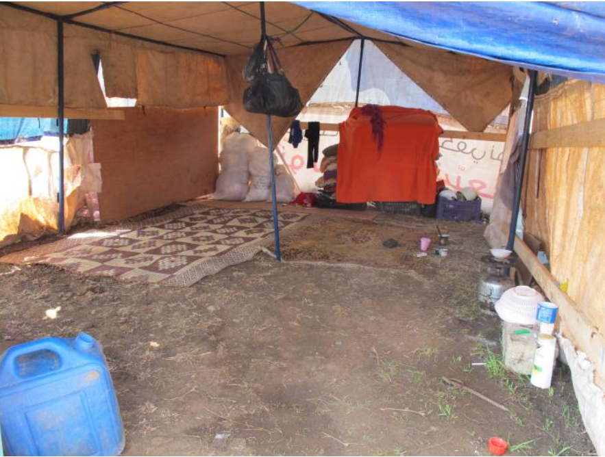
Lebanon/ Living conditions of Syrian Refugees in informal settlements

During the Aarsal clashes, with no possibility to flee the combat zone, refugees living in informal settlements sought refuge in private houses, collective shelters, schools and mosques.