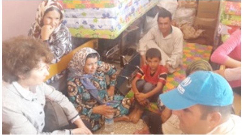
The UNCR Turkey Representative talking with a refugee family in YIBO boarding school

Today UNHCR's second airlift landed at Adana Airport in the late afternoon. Together, the eight planned flights are expected to bring in over 130,000 mats, 107,500 blankets, 15,000 sets of cooking utensils, 13,500 plastic sheets, and five prefabricated warehouses over the next eight days.