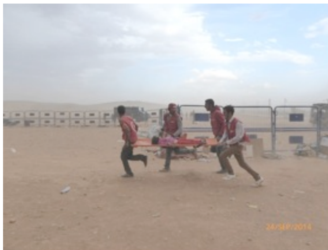
Turkish Red Crescent staff running to ensure emergency health care with a child on a stretcher at Yumurtalik border crossing

From 19 until 24 September, 840 refugees received medical attention (600 out-patients and 240 ambulance arrivals). It was confirmed that one of the three mine explosion victims reported on 24 September passed away. The other two are under intensive care unit at the Harran Education and Research University Hospital in Urfa.