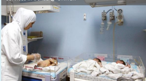
Support to public hospitals in delivering baby friendly services in Bekaa