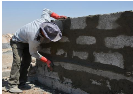
Iraq KRI

In Jordan a task force of the Shelter WG is in the final stages of writing guidelines for cash for rent - the cash component under the shelter sector. These guidelines will help to harmonize the methodology and level of assistance to Syrian refugees in urban/rural settings among members of the Shelter sector.