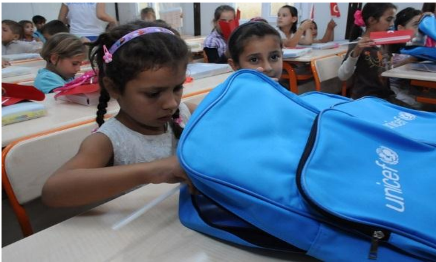
School bags distributed for Syrian students

Other educational activities include the on-going work to establish libraries in camps by UNICEF. IOM provided transport to 1,971 children attending two schools in Sanliurfa.