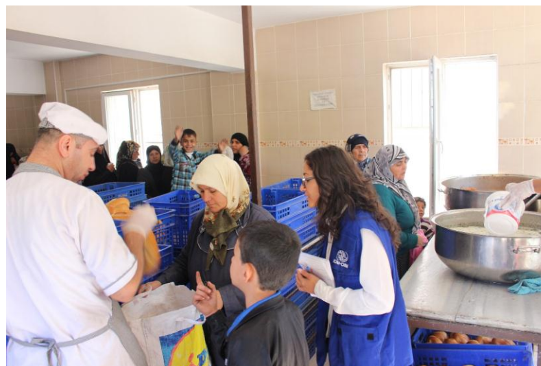
Soup kitchen run by Gaziantep municipality - Gaziantep, IOM, 2014

As a response to the influx in Suruc, IOM finalised the distribution of 1,500 food baskets for approximately 9,000 Syrians as of end of November.