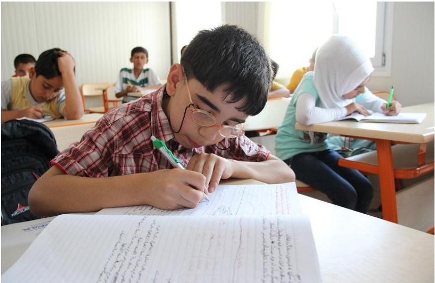
Syrian students in Osmaniye host community school

IOM continues to provide daily transport for 3,849 children in Sanliurfa and Mersin. With UNHCR, they also provided school transportation for 421 children living in urban areas in and around Malatya.