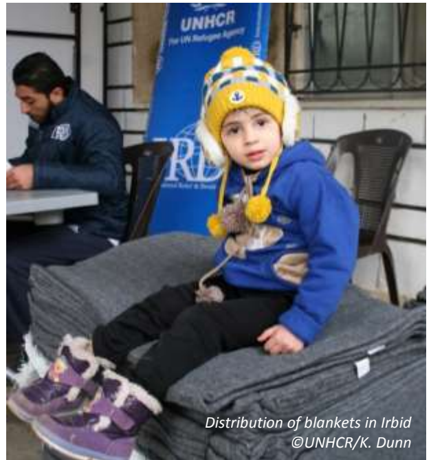
Distribution of blankets in Irbid