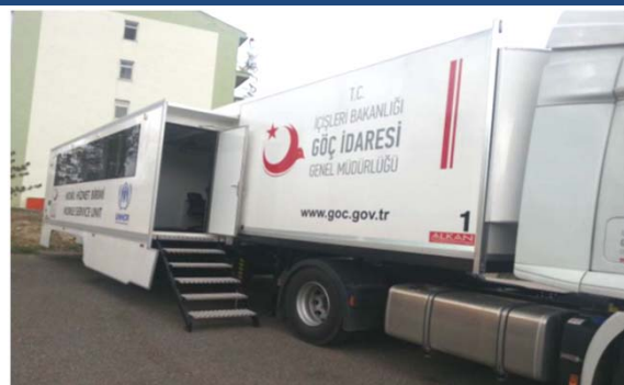
UNHCR procured mobile coordination unit / UNHCR 2014