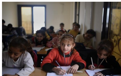
Syrian girl studying at Fard community school in Cairo.

The Education Working Group continue to promote effective coordination through quality information management and a continuous collaboration with other sectors such as protection, health and water, sanitation and hygiene.