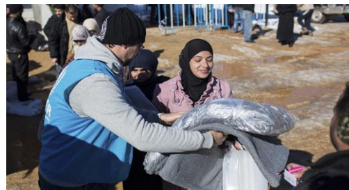
Syrian refugees receive blankets, jerry cans and fuel vouchers in Lebanon.

In Egypt, 30,710 vulnerable Syrian refugee received the provision of monthly cash assistance, as well as another 12 individuals who received emergency cash assistance.