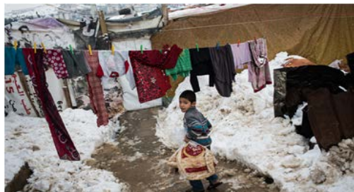
New Year brought winter for Syrian Refugees.

The Shelter Sector, which is active in Lebanon, Jordan and Iraq, aims at ensuring sustainable and appropriate access to shelter and infrastructure for refugees and host community members. Sector partners will focus on the availability, affordability and quality of shelter and on improving security of tenure in a holistic manner, addressing both the short- and long-term shelter needs of the most vulnerable refugees and members of the host communities.