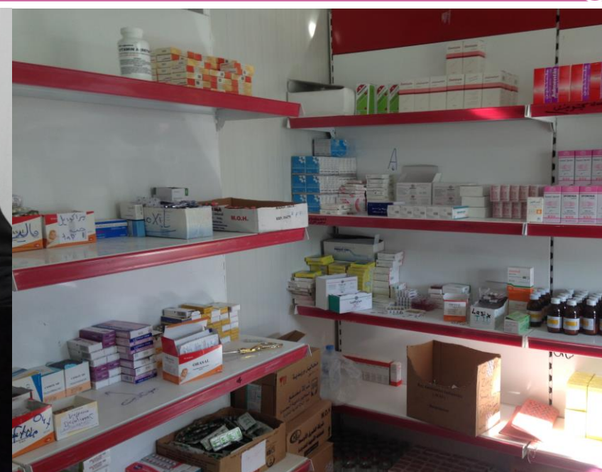
Kawergosk camp PHC's pharmacy, Erbil.