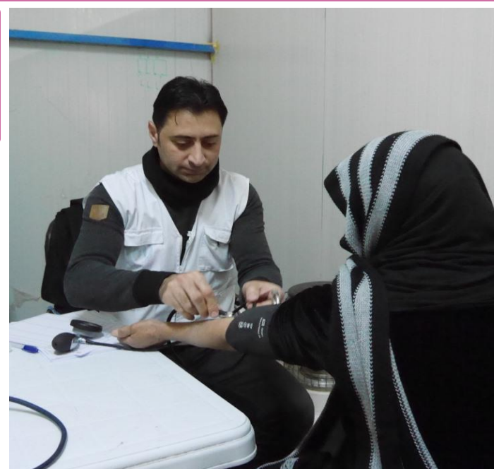
PU-AMI medical assistant checking blood pressure for a patient at Gwailan camp PH. Duhok.

30,470 consultations are provided to the Syrian Refugees in primary health care