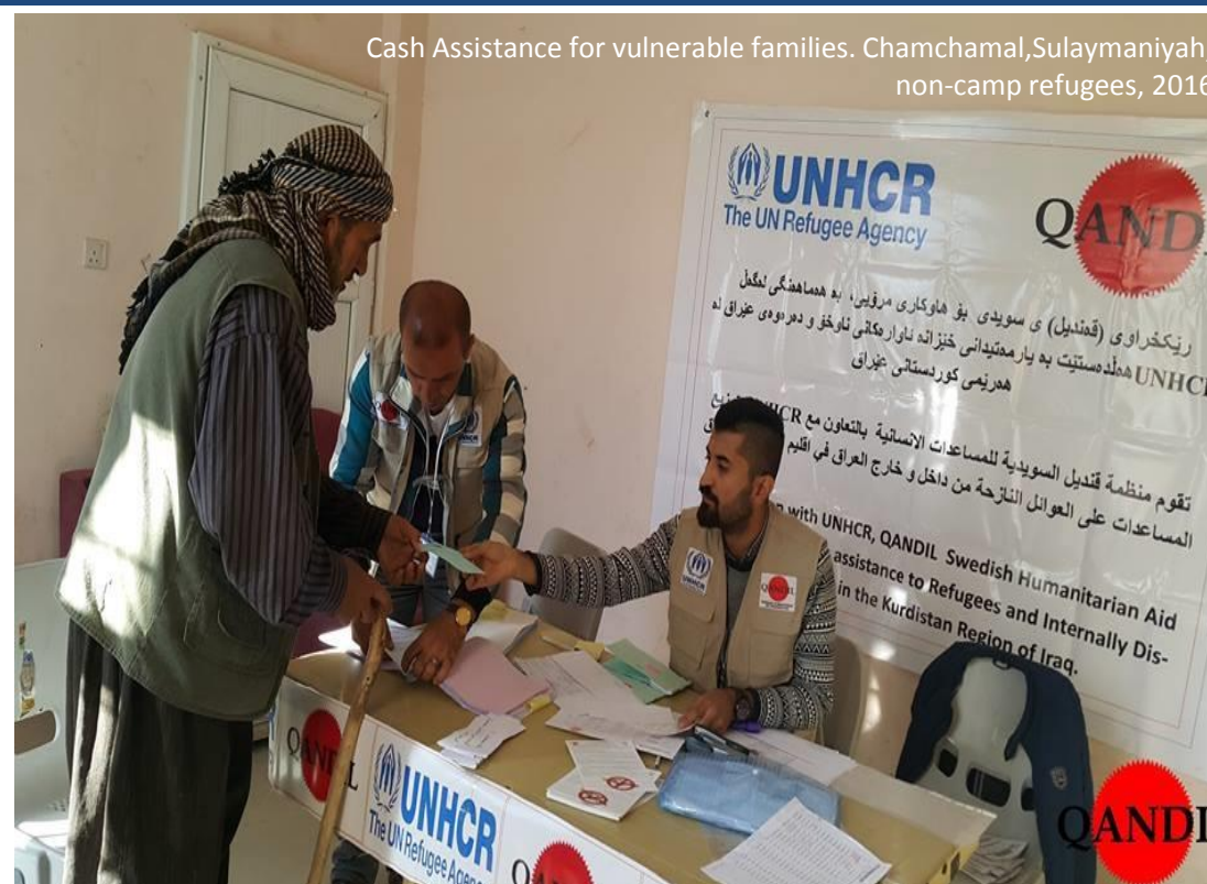
Cash Assistance for vulnerable families. Chamchamal, Sulaymaniyah, non-camp refugees, 2016