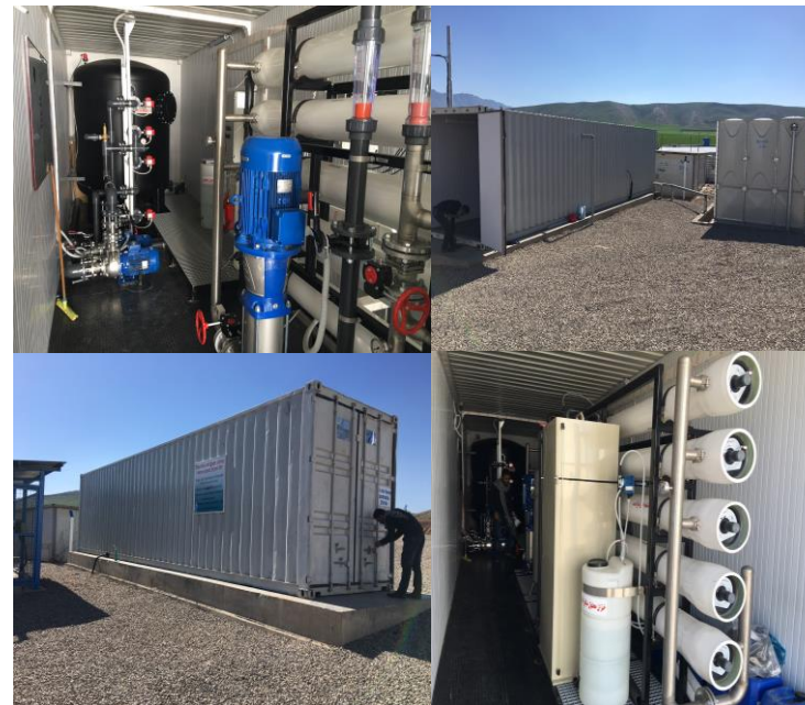
Basirma Camp/ Erbil, Recently installed Reverse Osmosis unit. Eng. Mazin Rajab. UNICEF. February 2016.

Anbar (Al-Obaidi): Access remained limited. Service provision continued, including: regular water supply, still unchlorinated due to security restrictions on chlorine provision; repair and maintenance of latrines and bathrooms and garbage collection.