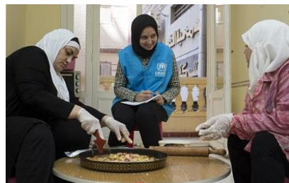
Syrian ladies in Alexandria, talking about their work with UNHCR/ Photo