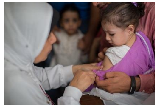
A Syrian girl being vaccinated during the national measles and rubella vaccination campaign.