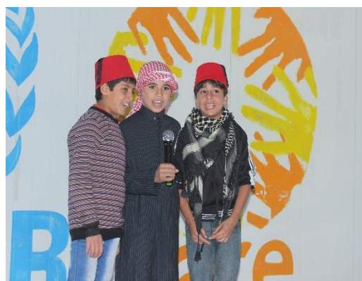
CARE/ UNHCR: Awareness Session

The materials were disseminated to the communities through 30 different organizations working in all governorates across the country and were posted in a number of locations, including registration sites, help desks, clinics, women's & girl's safe spaces, child friendly spaces and schools, both inside and outside refugee camps.