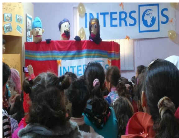
INTERSOS Puppet show

ARDD-Legal Aid's lawyer created a radio episode about domestic violence, laws and legislations underlying challenges and protection mechanisms. Also, ARDD-Legal Aid's Psychosocial Support Specialist spoke in Amman about the psycho-social aspects related to Early Marriage. In Jerash , UNHCR & Terre des Hommes (TDH) hosted Lawyers from ARDD-Legal Aid spoke about the legal aspects of SGBV touching on the penal code and the various types of violence against women which are criminalized by law. They also spoke about the status of women in Jordanian law.