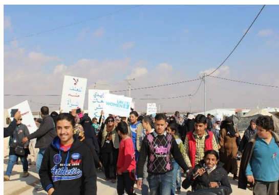
Zaatari Camp: UN Women Walking Marathon