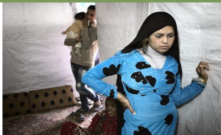
Hened married at 14. She is now a widow, her husband having died six months after they wed in Syria.

Refugee children, including the more than 142,000 Syrian children who have been born in exile since the conflict began, require specific assistance, as do survivors of violence, including SGBV, which has been a persistent feature of the conflict which affects women, girls, boys and men in different ways.