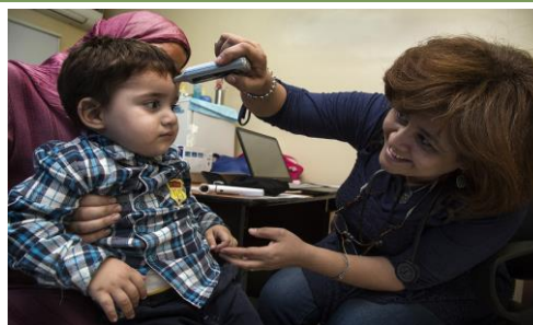
Primary and specialized health care provision through a variety of primary care clinics and specialized referral hospitals. Egypt - Cairo, S.Nelson/UNHCR