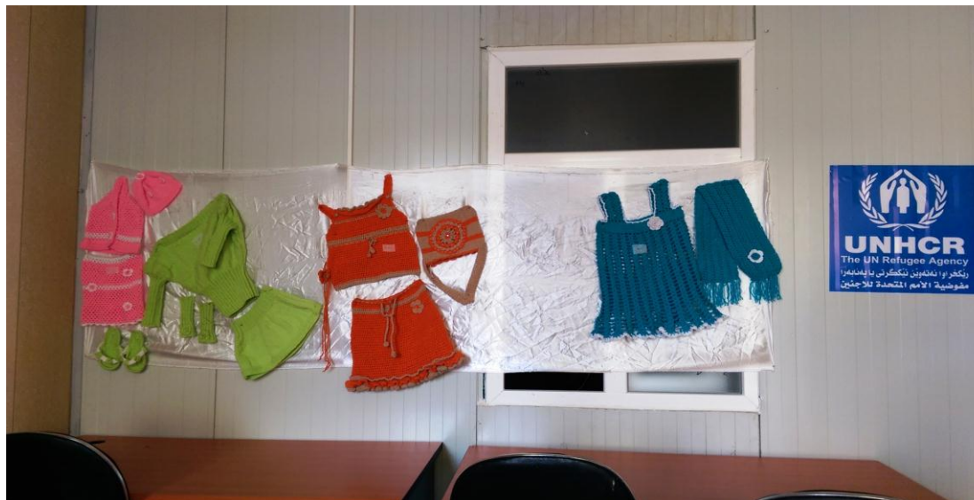
Women presenting their knitting work after vocational training in Akre camp.

A specific assessment on camp based businesses and market mapping has been completed covering all four refugee camps of Erbil governorate. Results to be shared with sector partners through a workshop in November. In addition 201 Syrian men, women and youth benefited from employment creation programs providing access to sustainable income for them and their households.