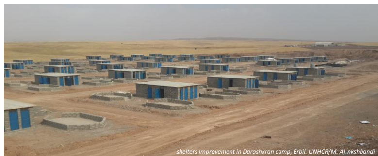
shelters improvement in Darashakran camp, Erbil.

Sulaymaniyah: An assessment has been conducted by UNHCR and Qandil to renovate 50 houses including electrical, plumbing and WASH works. These houses were selected according to UNHCR vulnerability criteria. Qandil started the renovation works and will be completed in October 2015.