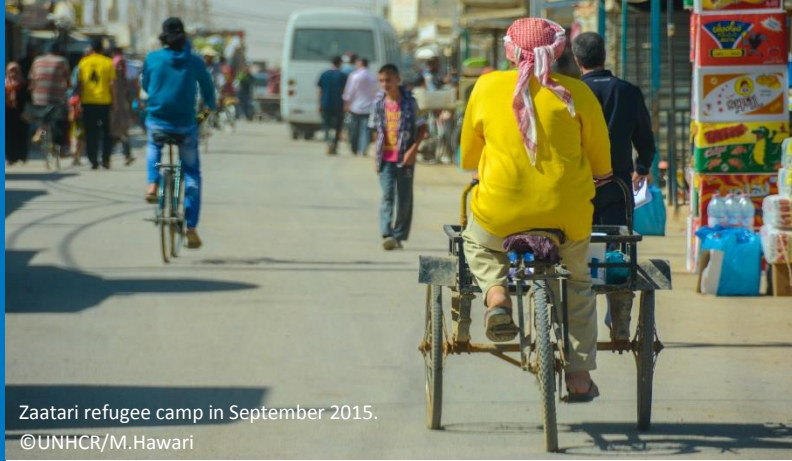
Zaatari refugee camp in September 2015.