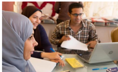
WFP Food voucher distribution in Egypt