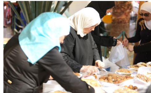
Syrian women displaying their food under livelihood projects, Cairo, Egypt UNHCR

A new targeting mechanism was put in place, utilizing, MEB Gaps Analysis Approach to select beneficiaries, resulting in identifying a total of 53,340 as most vulnerable to access food vouchers for August. The final list of beneficiaries for the assistance reflected a reduction of 12,917 individuals from the previous distribution figures of whom 7,278 were also receiving cash assistance.