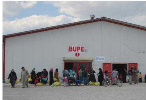
Syrians supported by WFP and TRC's e-food card programme shopping in the camp markets.

WFP continues to chair the Food Security Working Group. The group meets in Gaziantep once monthly. In June, the group welcomed a Cash and Voucher specialist funded by ECHO who is conducting a multi-dimensional study about the provision of cash and voucher assistance in Turkey.