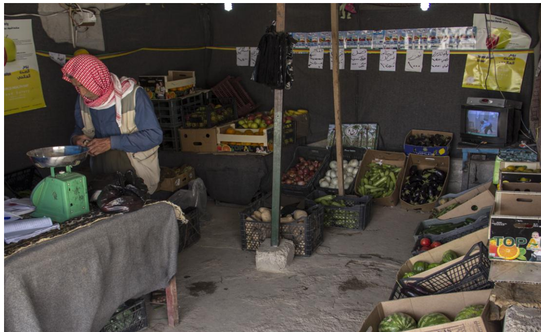
Akre Settlement, Duhok